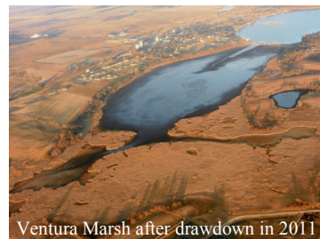
Ventura Marsh after drawdown in 2011

A water level management plan has been developed by the DNR to guide the marsh management. The marsh will be kept in a low water state for one or two growing seasons, depending on the vegetation response. This will allow the marsh to naturally revegetate with perennial wetland plants. It will also allow the bottom sediment to consolidate. The management plan, as well as pictures of the project, are available on the CLEAR Project web site at: www.clearproject.net/marsh.htm .