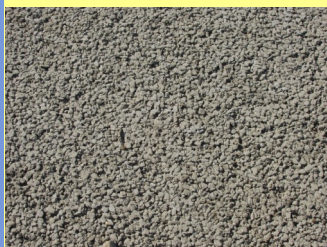
Up-close view of pervious concrete installed in 2011.

Urban conservation practices continue to be installed in the Clear Lake watershed. Previously, the majority of the urban conservation practices installed were grit collection chambers to treat runoff that had already entered into the storm water drainage system. In 2011, infiltration-based practices were focused on to help reduce the amount of runoff entering the storm drain system and then into Clear Lake. Practices installed in 2011 included three rain gardens, one permeable paver block driveway, one pervious concrete parking lot, and one storm water infiltration trench. As a result of the practices being installed, up to 21,000 gallons of contaminant-laden storm water runoff will no longer reach the lake during each rain event. The largest of the projects was the new parking lot behind the VFW. Strips of pervious concrete with a rock infiltration bed underneath were installed to infiltrate rain water that falls on the parking lot. The effectiveness of the system was tested this fall by rapidly releasing 2,000 gallons of water onto the parking lot. All of the water released was quickly infiltrated. A video of the demonstration is available at: http://www.youtube.com/watch?v=eFzKquEEAwA